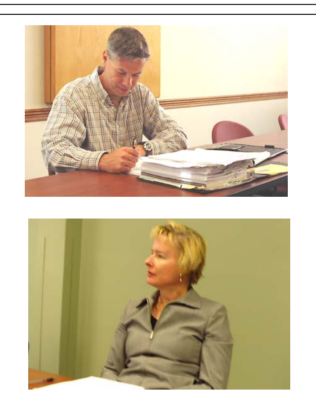
The Accreditation Self-Study Steering Committee has been hard at work editing the draft Self-Study Report. A final draft will be available for Community review beginning February 2011.