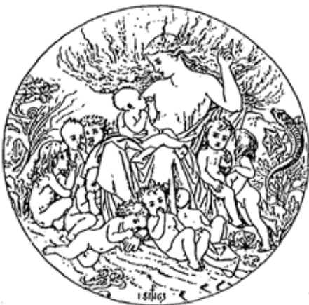
Lona particularly devotes her attention to the youngest of the Little Ones, just as Kingsley's Mrs Doasyouwouldbedoneby does to the youngest Water Babies in this illustration by Sir. Joseph Noel Paton.

In Lilith , by contrast, MacDonald's allusions to The Water Babies are critical satire in the form of ironic inversion-parody. Kingsley himself ironically parodies unimaginative Victorian moral education when he names the 'purely loving' aspect of the great wise-woman figure of his book, Mrs Doasyouwouldbedoneby, and her 'teaching-through-suffering-and-sorrow' aspect, Mrs Bedonebyasyoudid. MacDonald creates two very similar characters, but gives them the strikingly simple names of Lona and Mara. Kingsley's mock-mechanistic explanation for the contrasting behaviour of these two ladies is stylistically unsuccessful, seriously undennining the mood he attempts to create. MacDonald's unobtrusive indication of the opposite backgrounds of Lona and Mara, by contrast, possess a brilliant inevitability. As daughter of the prelapsarian Adam and his first wife Lilith, Lona must inevitably personify unfallen Love, while Mara, as daughter of the fallen Adam and Eve, must equally inevitably personify healing Sorrow and Care. Equally profound is the way MacDonald handles the consequences of his inversion of the environment of the children cared for by the two ladies. The waterless state of his Little Ones becomes one of the most important metaphors in Lilith , whereas, from nearly all important aspects, Kingsley's Water Babies could just as well be land babies.