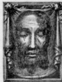
True Image of the Holy Face of our Lord Jesus Christ, Religiously venerated and kept in Rome, in the Basilica of Saint Peter, in the Vatican.