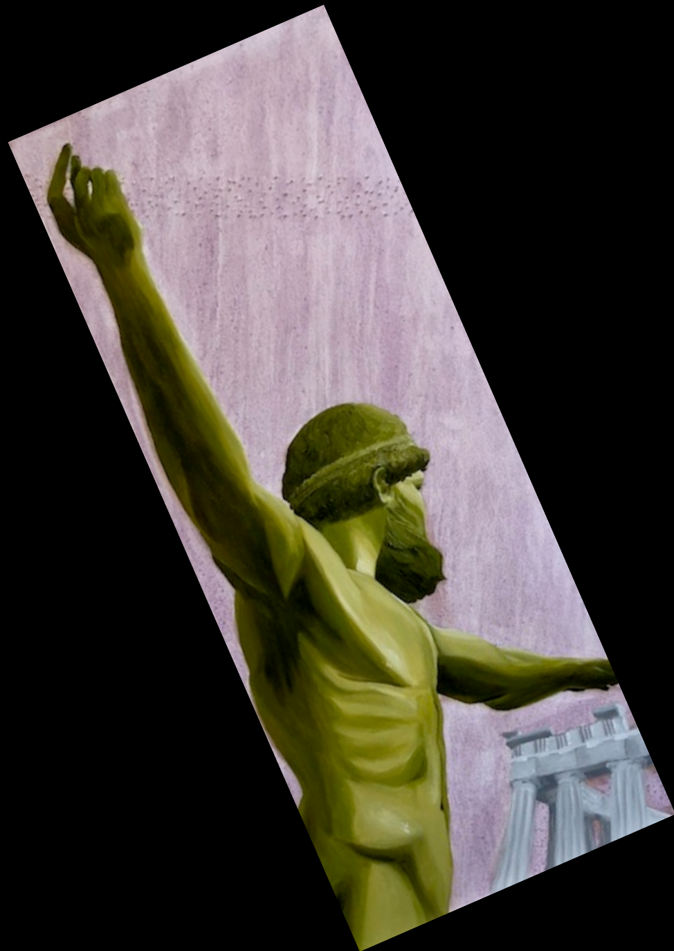
Gamma Oil, glass bead, and thread on canvas 14" x 36"