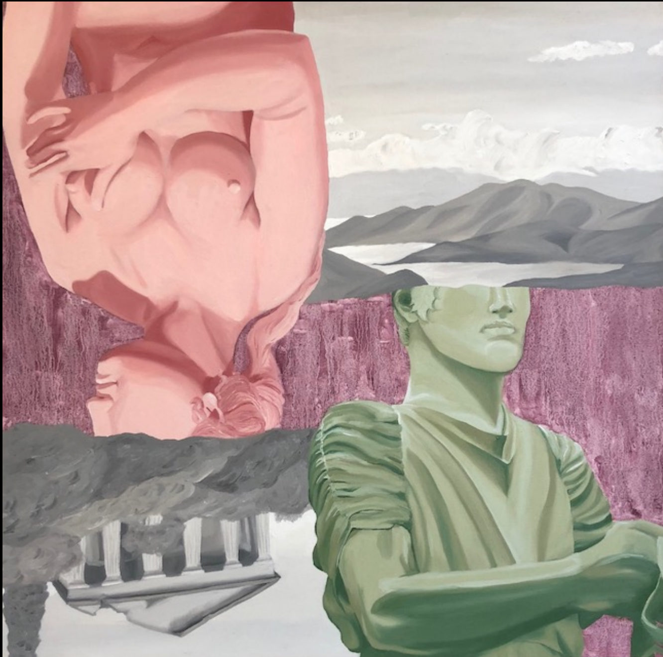
Alpha Oil on canvas 32" x 32"