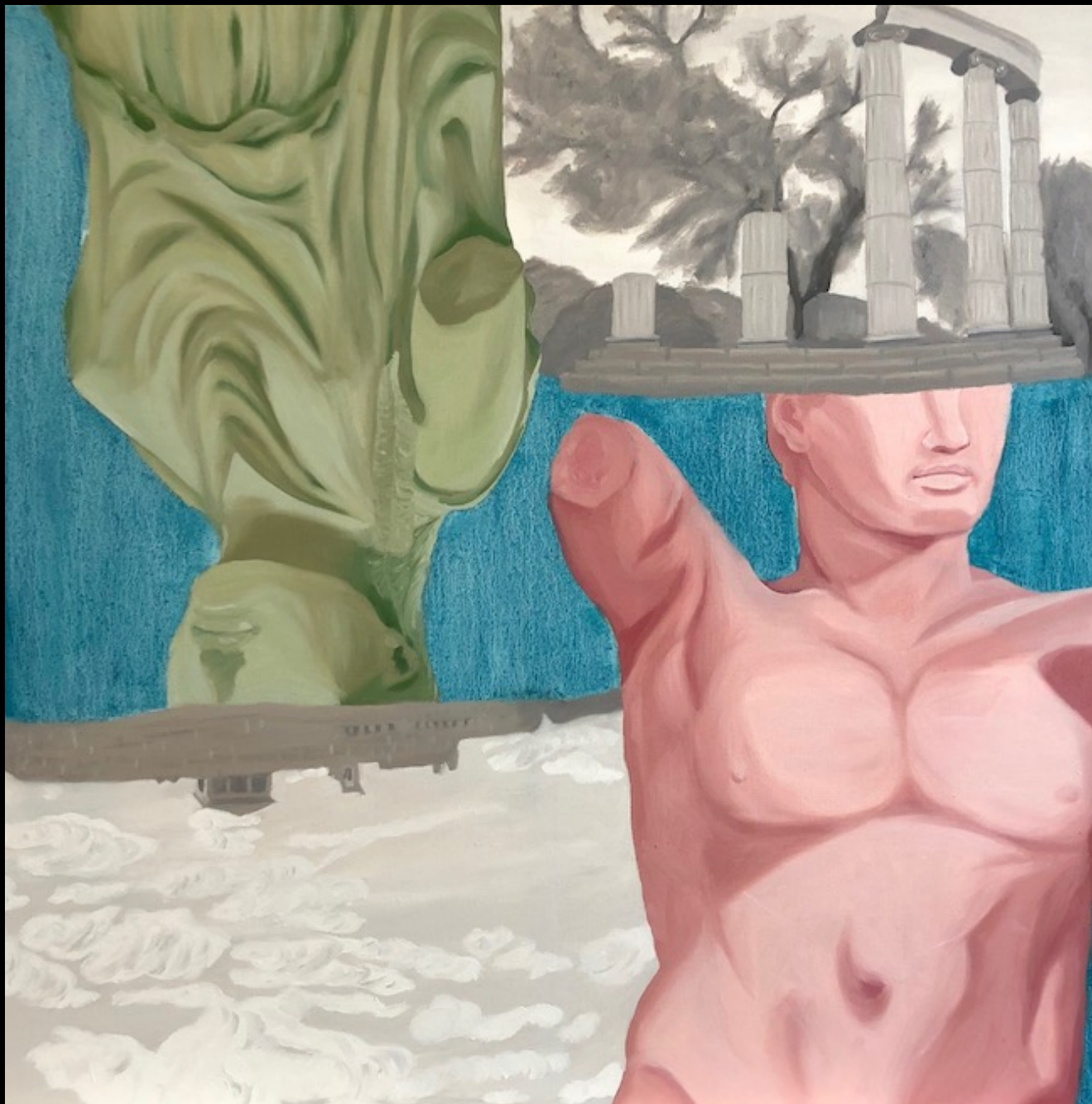
Beta Oil on canvas 32" x 31.5"