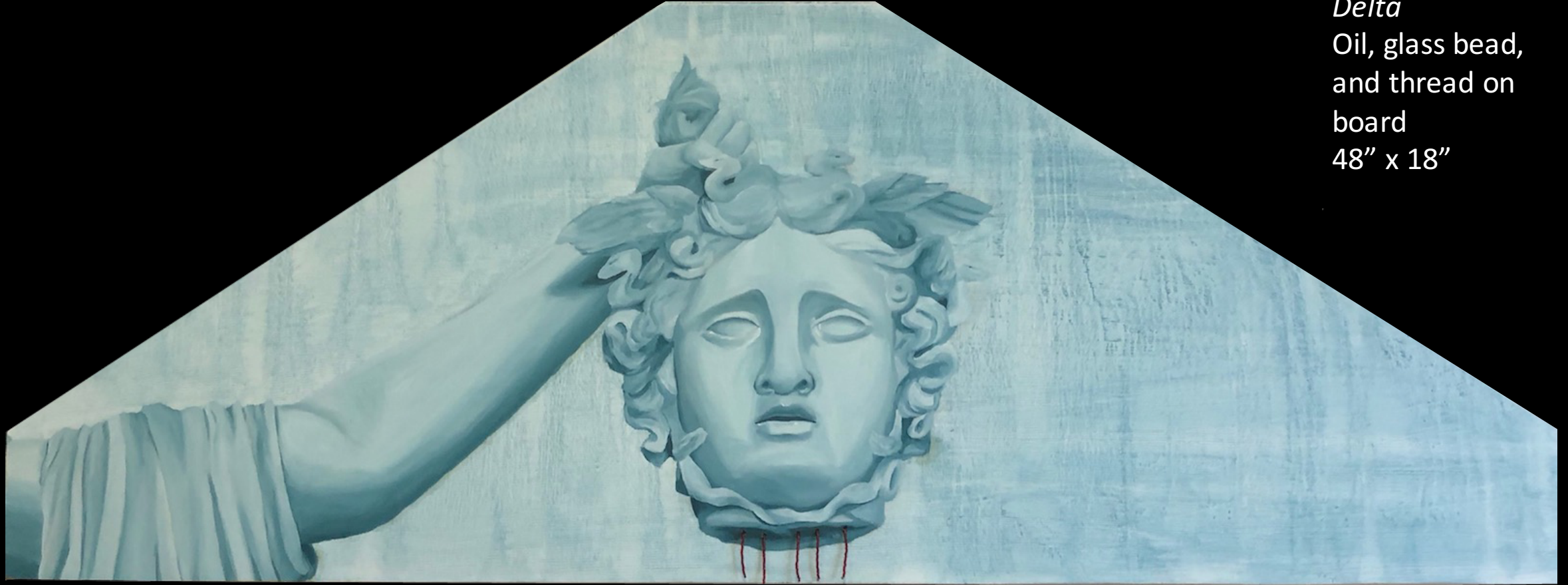
Delta Oil, glass bead, and thread on board 48" x 18"