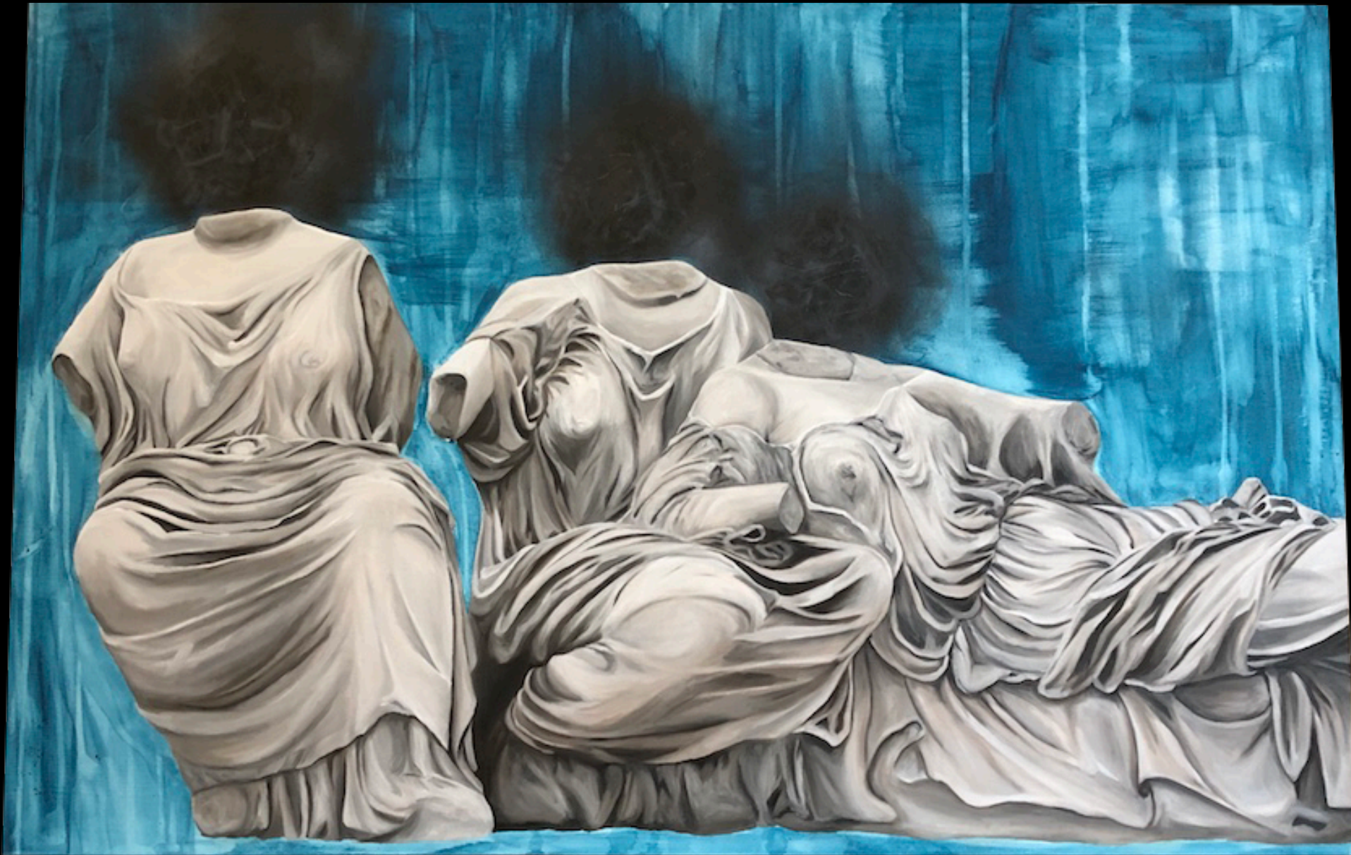
Epsilon Oil, spray paint, and acrylic on canvas 48" x 31"