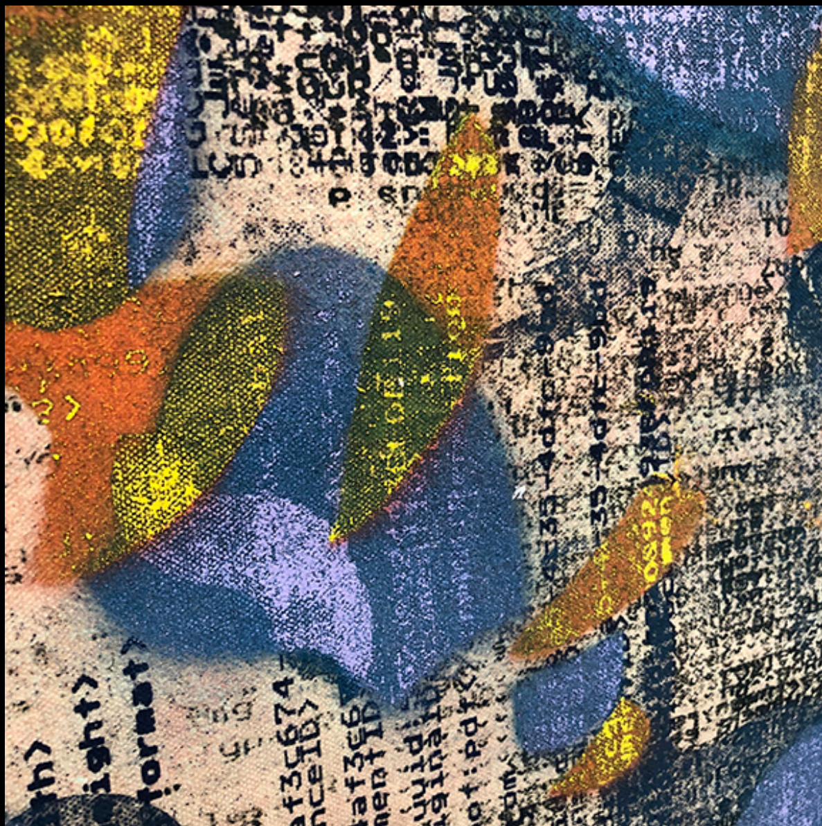
Archive 0313, Detail Image