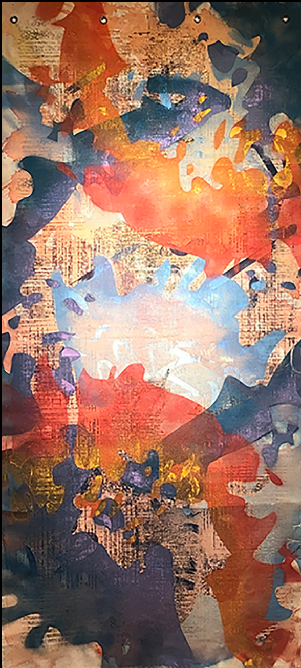
Archive 0313 Acrylic and spray paint on canvas 33"x 72"