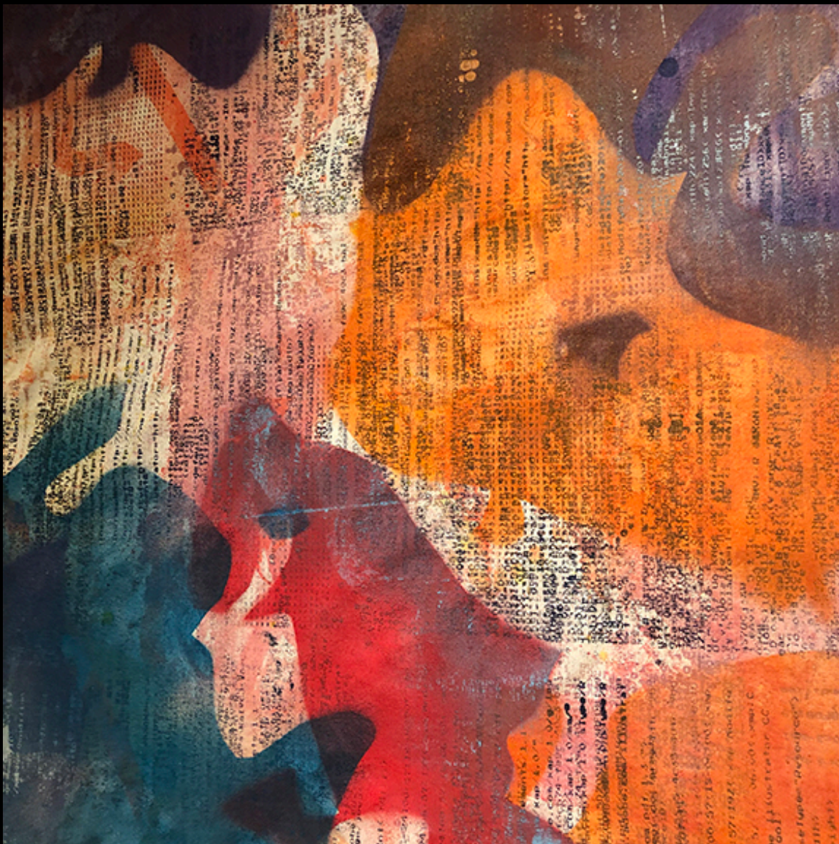
Archive 0329, Detail Image