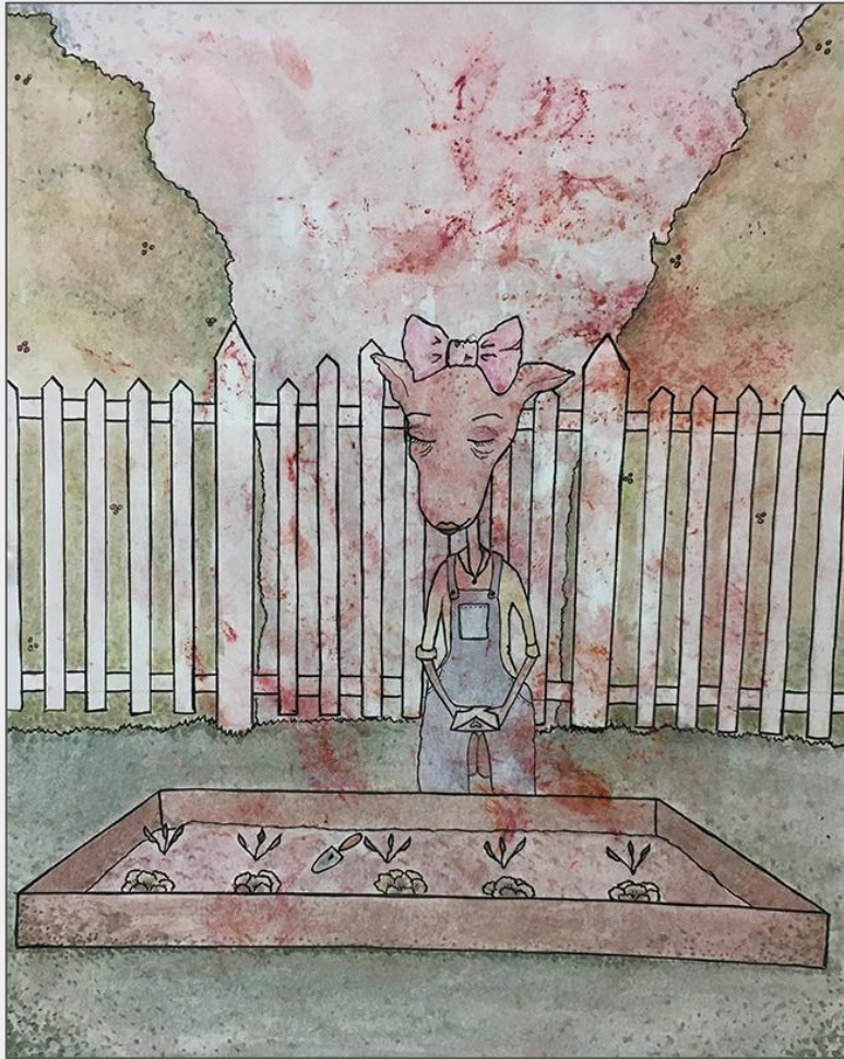
Timeless Love Odes Watercolor and pen 9"x11"