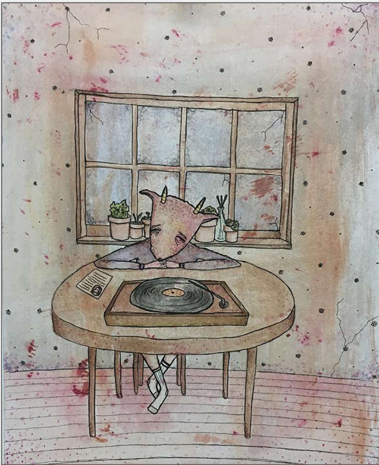
Post Mortem Listening Watercolor and pen 9"x11"