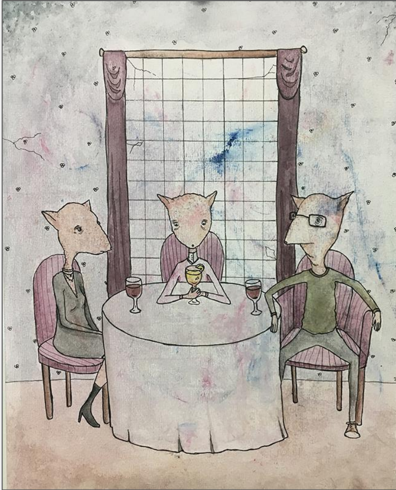
A Glassy Evening Watercolor and pen 9"x11"