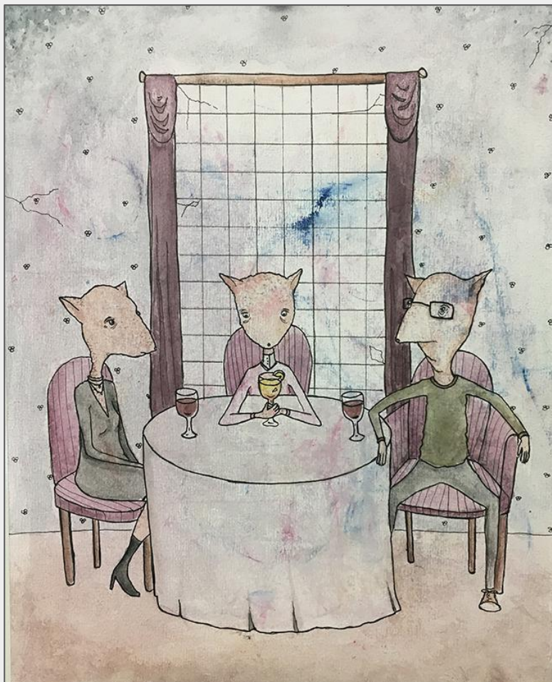
A Glassy Evening Watercolor and pen 9"x11"