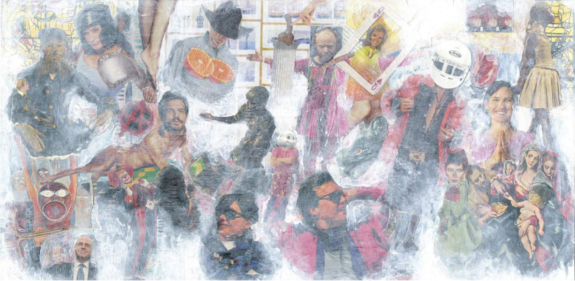
Exploring Gender, Acrylic and collage on cradled panel, 12x24