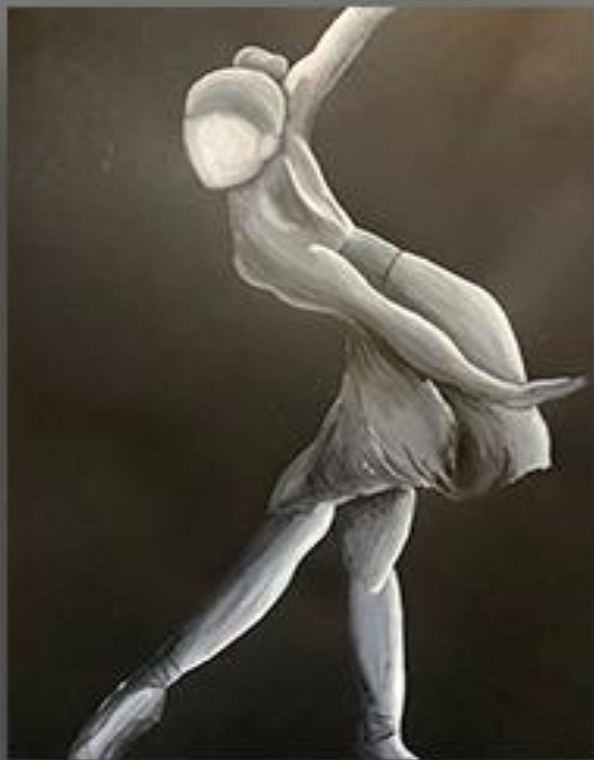
PAS DE DEUX ARCYLIC ON PAPER 28" X 19"