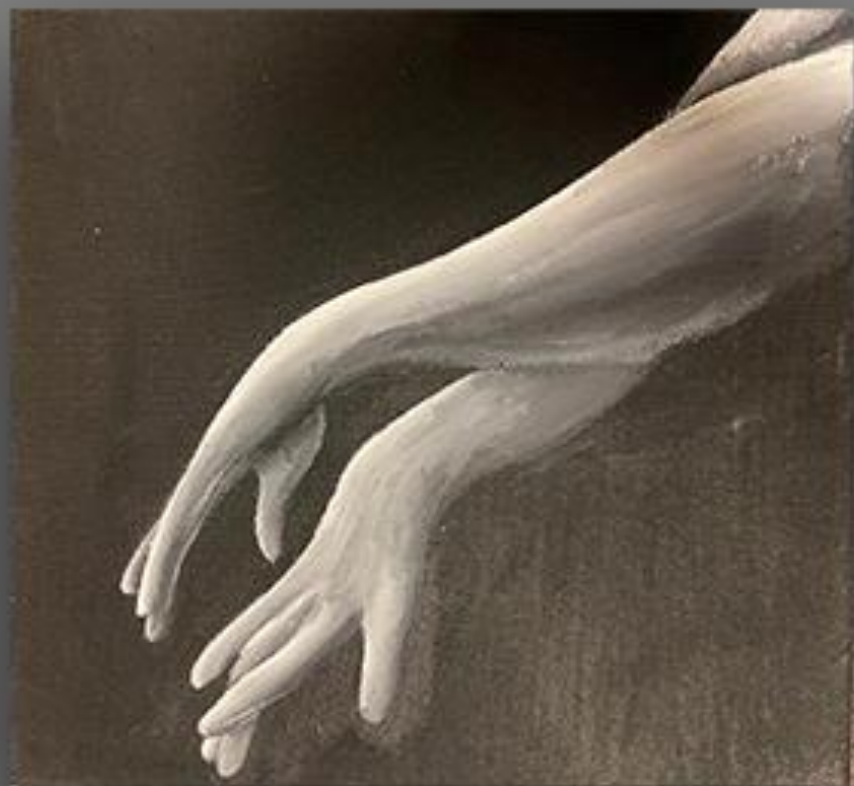
DANCER'S HANDS ACRYLIC ON STRETCHED CANVAS 12" X 12"