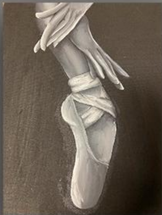
BALLET SHOES ACRYLIC ON STRETCHED CANVAS 14" X 12"