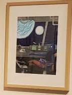
Small caption label for the third painting.