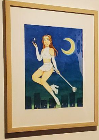
Small caption label for the first painting.

Informational text panel on the left wall.