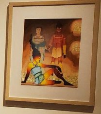
Small caption label for the fourth painting.