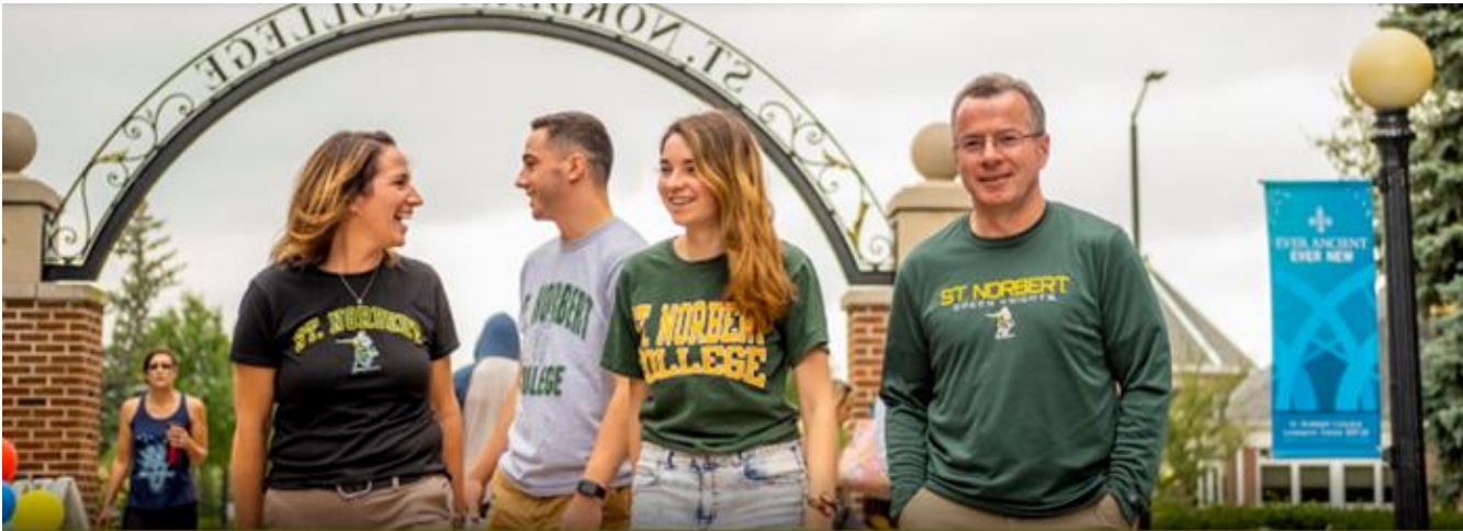
Group by St. Norbert College Parents